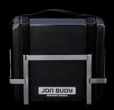
Available in 4 variations - rail and bulkhead mounts with white or carbon style casing.