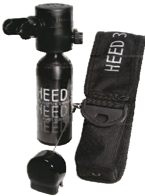
P/N 175-001 with holster 175-002 without holster