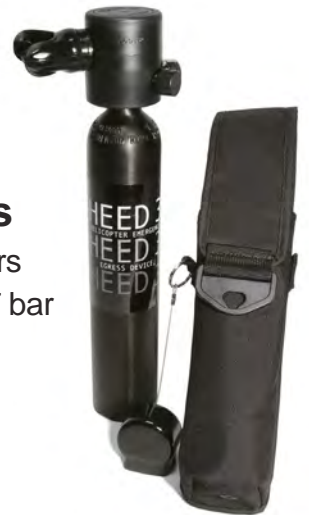
P/N 300-001 with holster 300-002 without holster