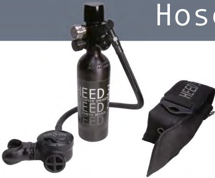
P/N 200-003 with holster | 200-004 without holster